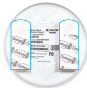
Double-sided adhesive strips