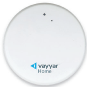
Vayyar Home device